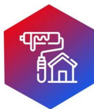
Sand Blasting & Painting