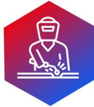
Structural Fabrication and Erection